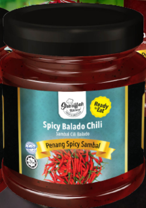
Spicy Red Chilli