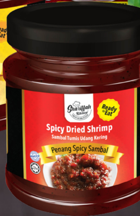
Spicy Dried Shrimp