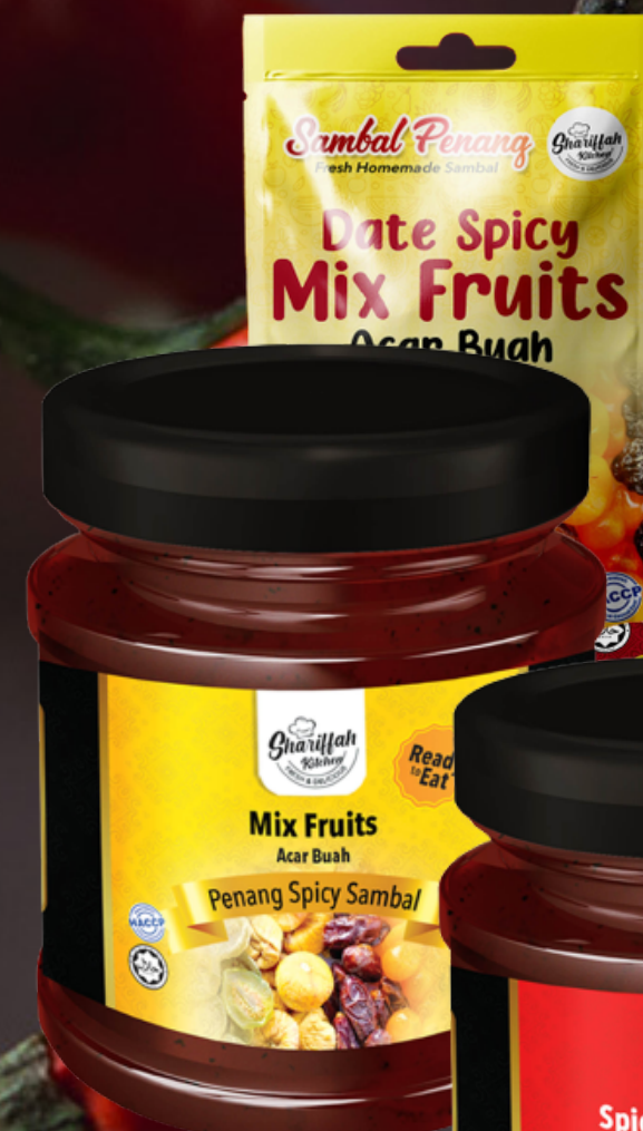
Date Spicy Mix Fruits